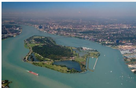
Detroit River Belle Isle