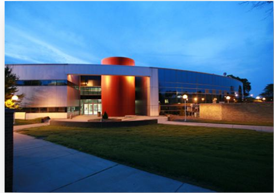
Henry Ford Community College

One night I was worrying how I would support myself since I was on welfare, and what I would do when the children grew and left home. I realized it was time to go back to school and be an example to my children. At the time I was doing odd jobs for extra money, being a gofer for a contractor who renovated homes. I was very much interested in electricity and how it works. So I studied a GED book and took the test and passed. Then I applied for my tuition waiver with the Native band to go to college. I went to Henry Ford Community College for three years and received my Associate's Degree in Electrical Science/Electronic and Robotics. I missed only one day of school which was hard for me to miss when I was taking calculus. The time when I didn't have a car to go to school, I rode my bike 14 miles even in winter, so that I would not miss a day.